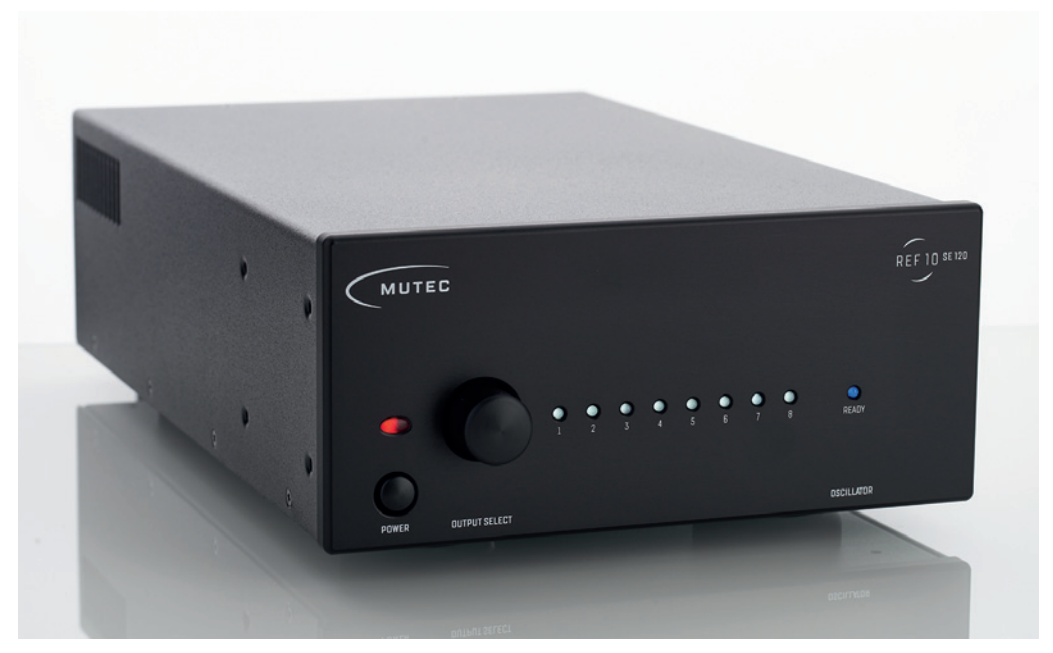
The black knob is used to turn off the clock outputs that are not needed. On the right hand side the blue LED is permanently lightning when the oscillator warm-up process is completed

extremely low phase noise values of at least -120dBc measured at 1 Hertz offset from the carrier frequency of 10 Megahertz and clearly surpass the basic REF10 model (-116dBc at 1 hertzt) in this key aspect metrologically unambiguous.