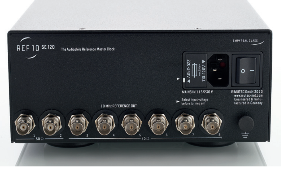
The clock outputs of the REF 10 SE120: 2 x BNC 50\Omega and 6 x BNC 75\Omega

But what is this phase noise all about and why is this value so important for a clock in the audiophile world? Intuitively, we know that low noise in a system is better than high noise. Walter Schottky explained the physical phenomenon as a measurable irregular current fluctuation. If we amplify this fluctuation and make it audible via a loudspeaker, we hear the typical noise that we commonly understand as noise and which also gave the phenomenon its name. But this rather analog understanding of noise has only a partial connection with the term