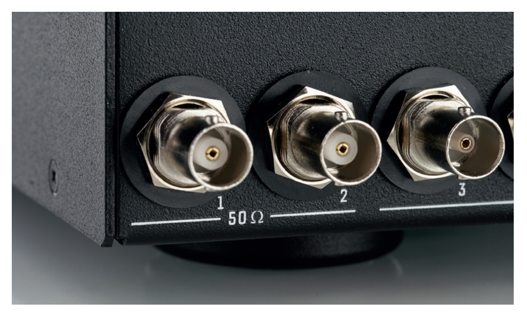
The two 50\Omega BNC outputs in detail. The difference between 50\Omega BNC sockets (outputs 1 and 2) and 75\Omega BNC connectors (output 3) can be identified easily in regards of their different white isolation material thickness

to an audible gain in sound quality. I am set on a hard head-to-head race between the two clocks, in which I will work out the finest differences between the two clock generators by switching back and forth several times between them.