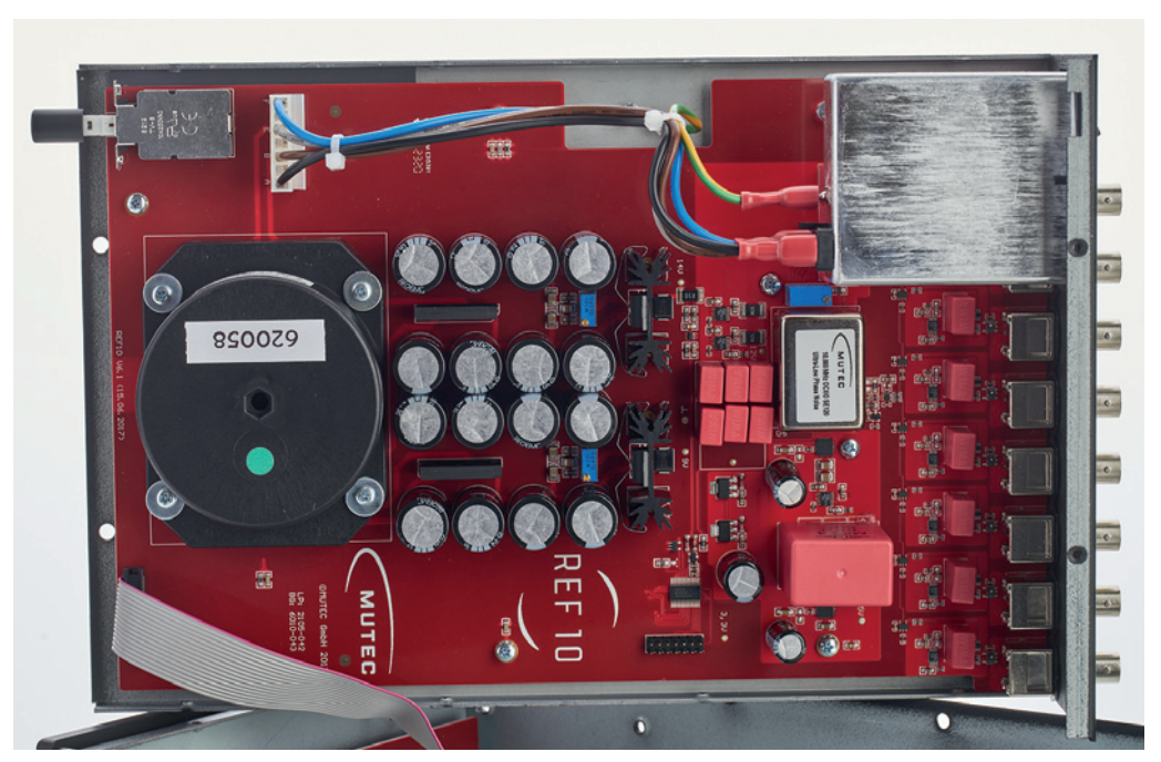
The inner life of the REF10 SE120 from left to right: large dual toroidal transformer, lush filter capacitances, sophisticated voltage stabilization, oscillator circuitry and extensive power input filtering

Accordingly, I carefully prepare my listening test. As always, my tried and tested music server with XEON processor and Windows Server 2019 in Core Mode, tuned with Audiophile Optimizer, is used as the audio source. JPLAY Femto, MinimServer, JRiver26 and Roon Core are installed on the server as music management software. My two cascaded MUTEC MC3+USB are interconnected on the USB path to my PS Audio DirectStream DAC and are to draw their clock from either the REF10 or the REF10 SE120.