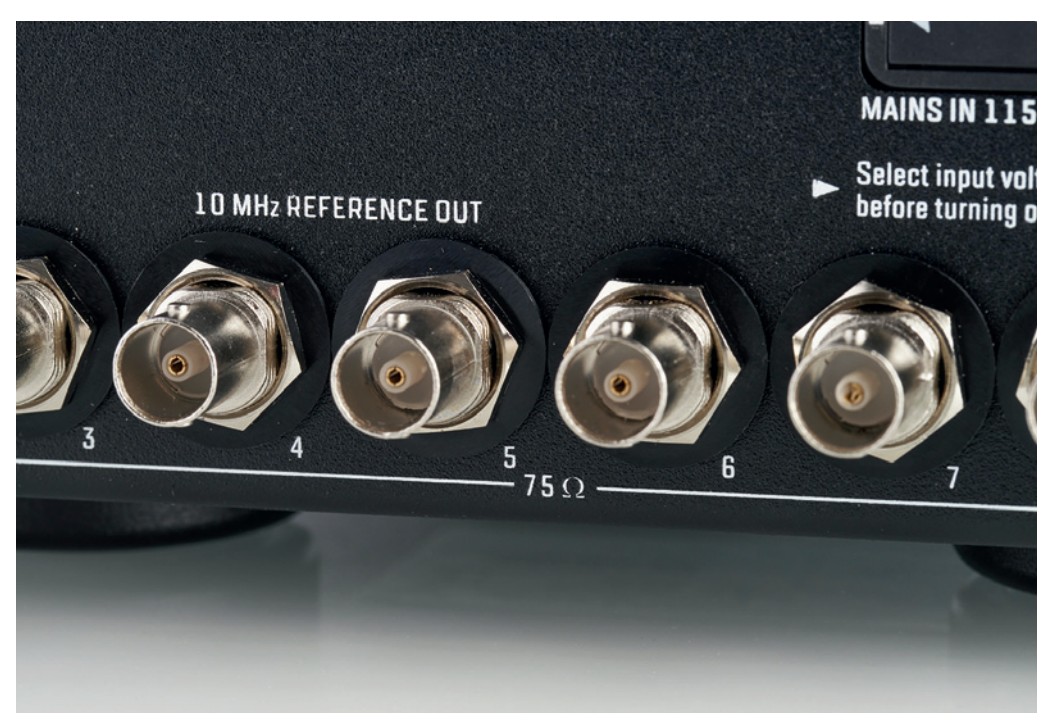
The 75 \Omega outputs in detail

used in modern electronics. Here, noise is generally characterized much more as any unwanted signal that interferes with the main signal. It can interfere with any parameter such as voltage, current, phase or frequency. In the case of an oscillator, we are primarily interested in the frequency stability of its signal. Here we distinguish between the long-term stability and the short-term stability. The long-term stability refers to the amount by which the absolute clock frequency drifts over a longer period of time. Causes can be for example aging processes or temperature fluctuations of components. Even if this is important for telecommunications or studio applications, for example, it has, according to MUTEC, no influence on the quality of the reproduction of digital audio material.